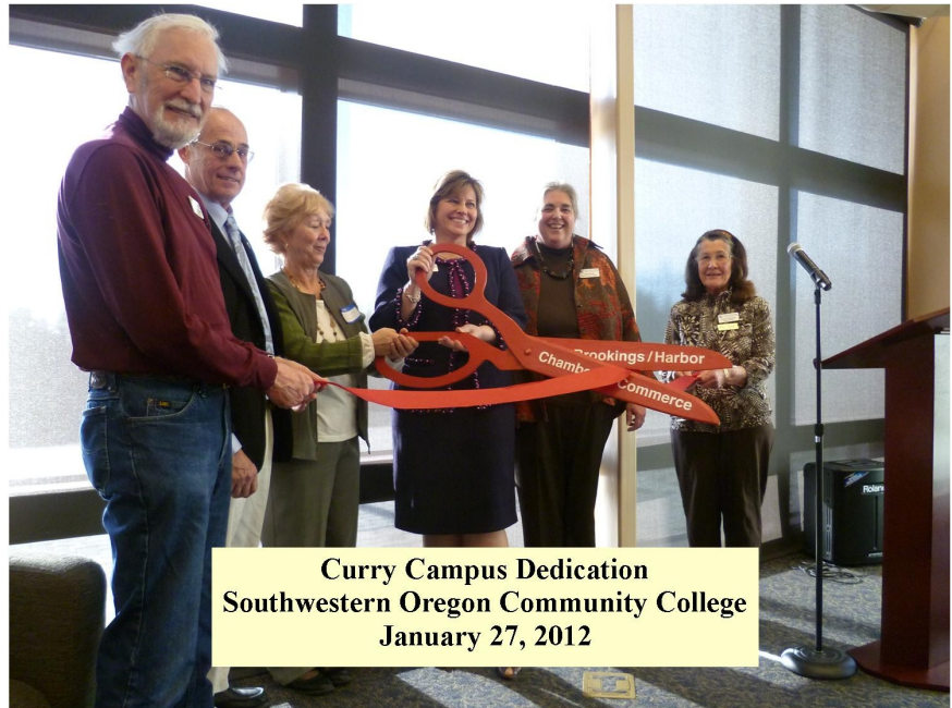
Curry Campus Dedication Southwestern Oregon Community College January 27, 2012